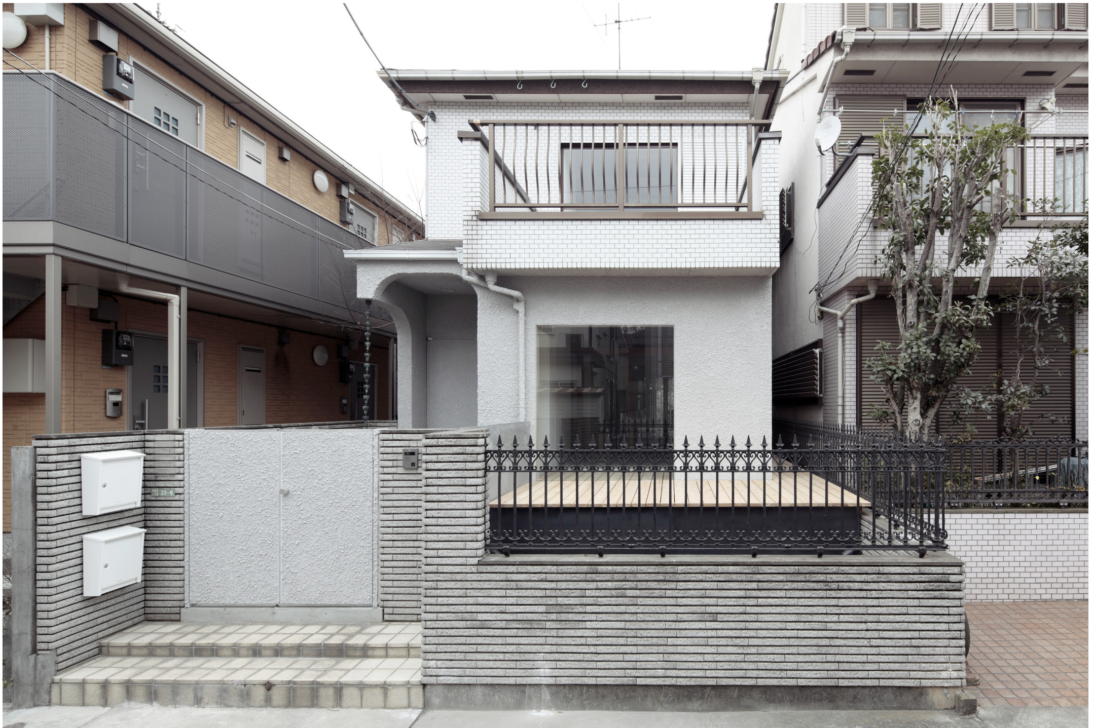
HANEKI G House