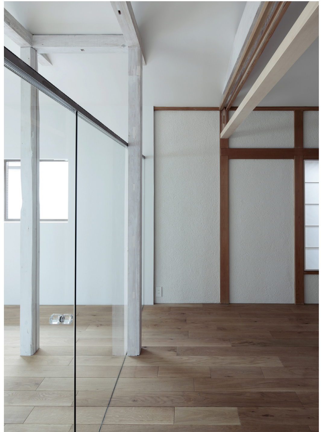
Makoto Yamaguchi Design Inc.