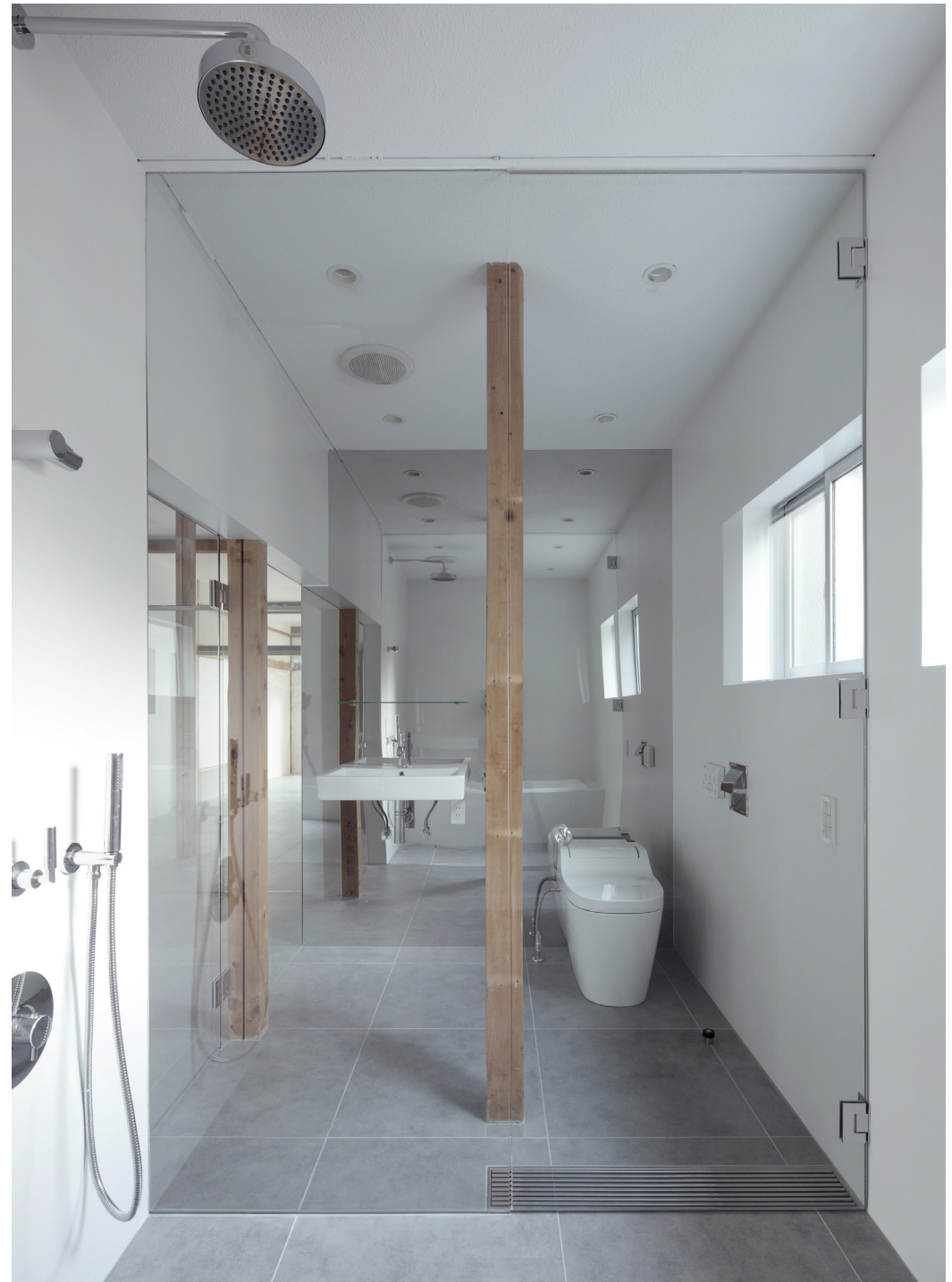
Makoto Yamaguchi Design Inc.