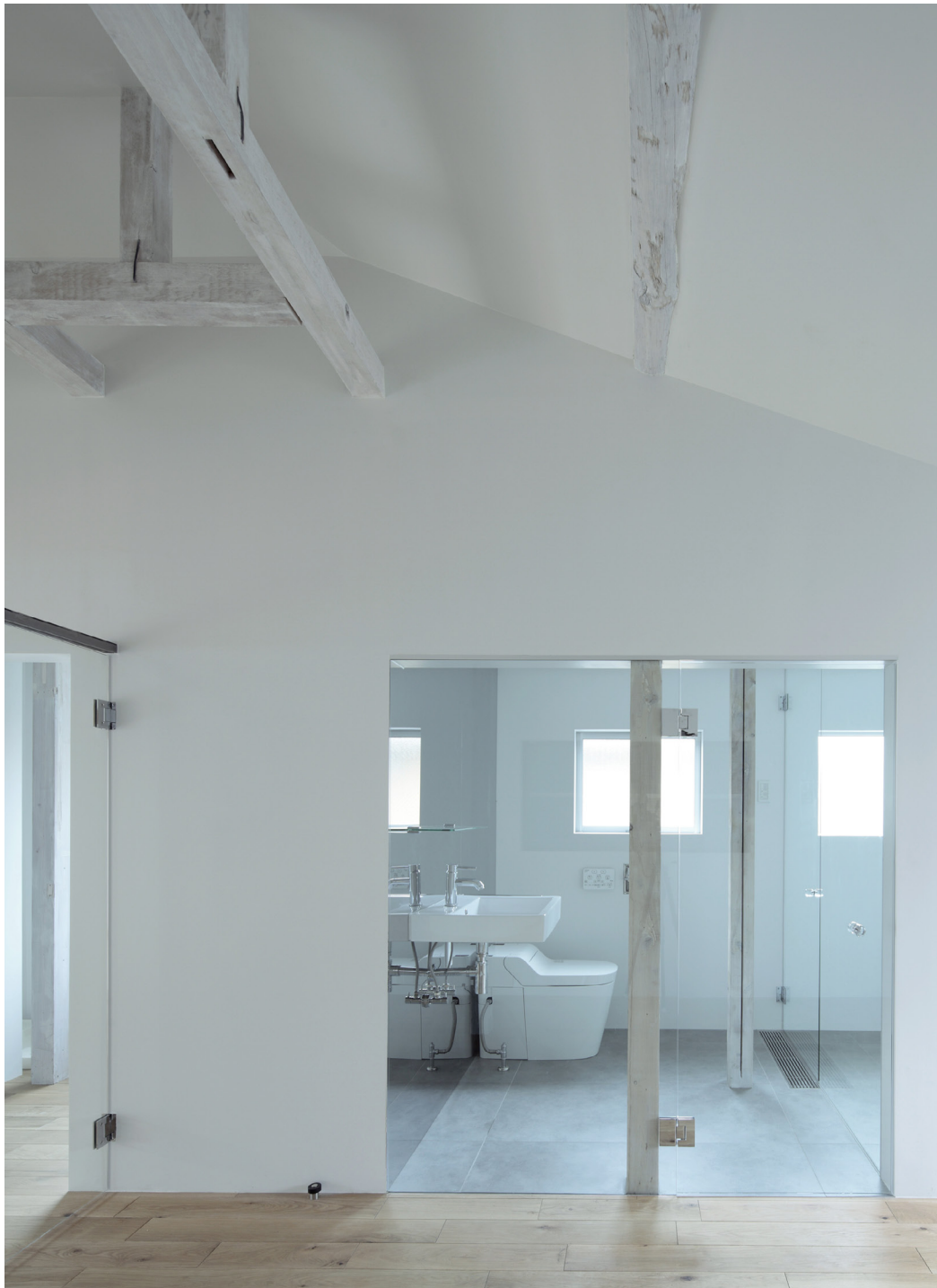
HANEGL G House