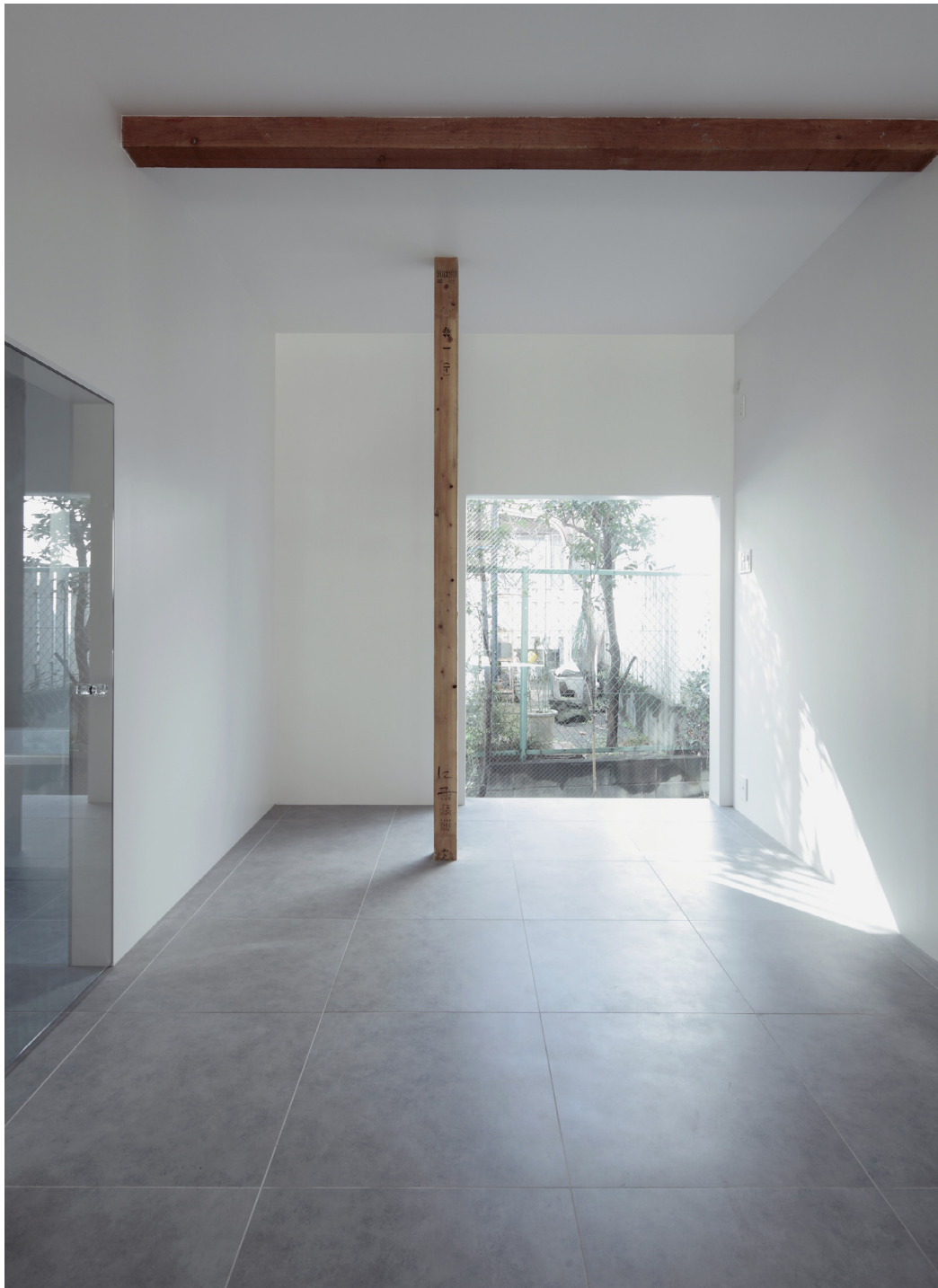
HANEGL G House