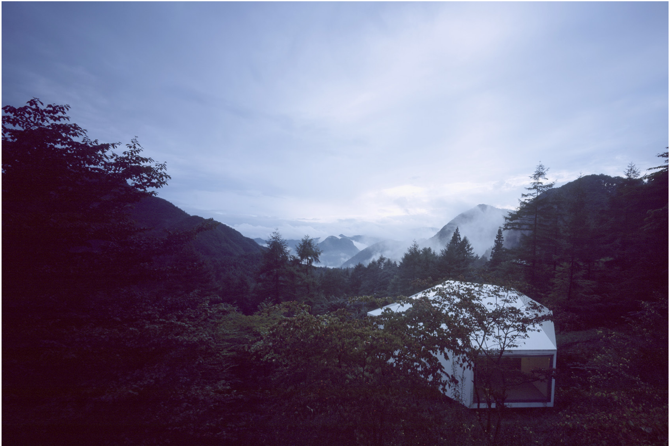
Villa / Gallery in Karuizawa