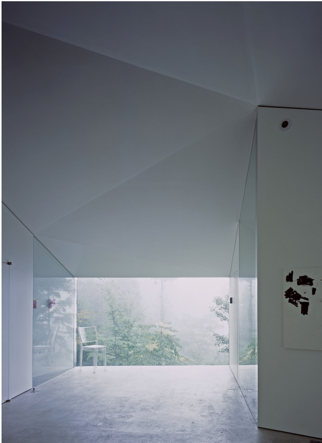
Villa / Gallery in Karuizawa