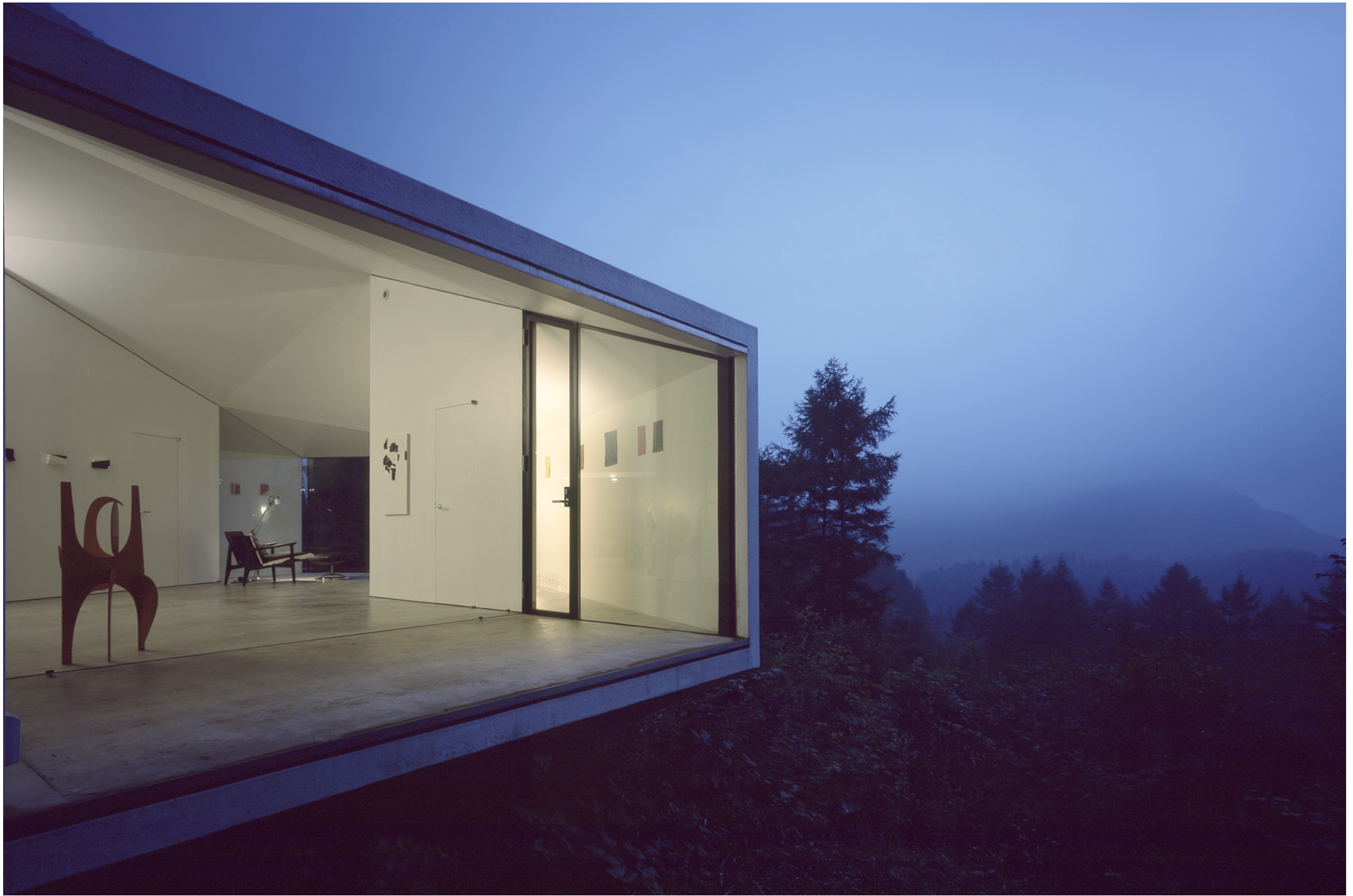
Villa / Gallery in Karuizawa