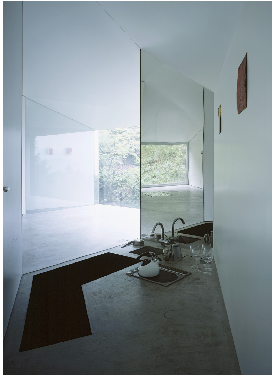
Makoto Yamaguchi Design Inc.