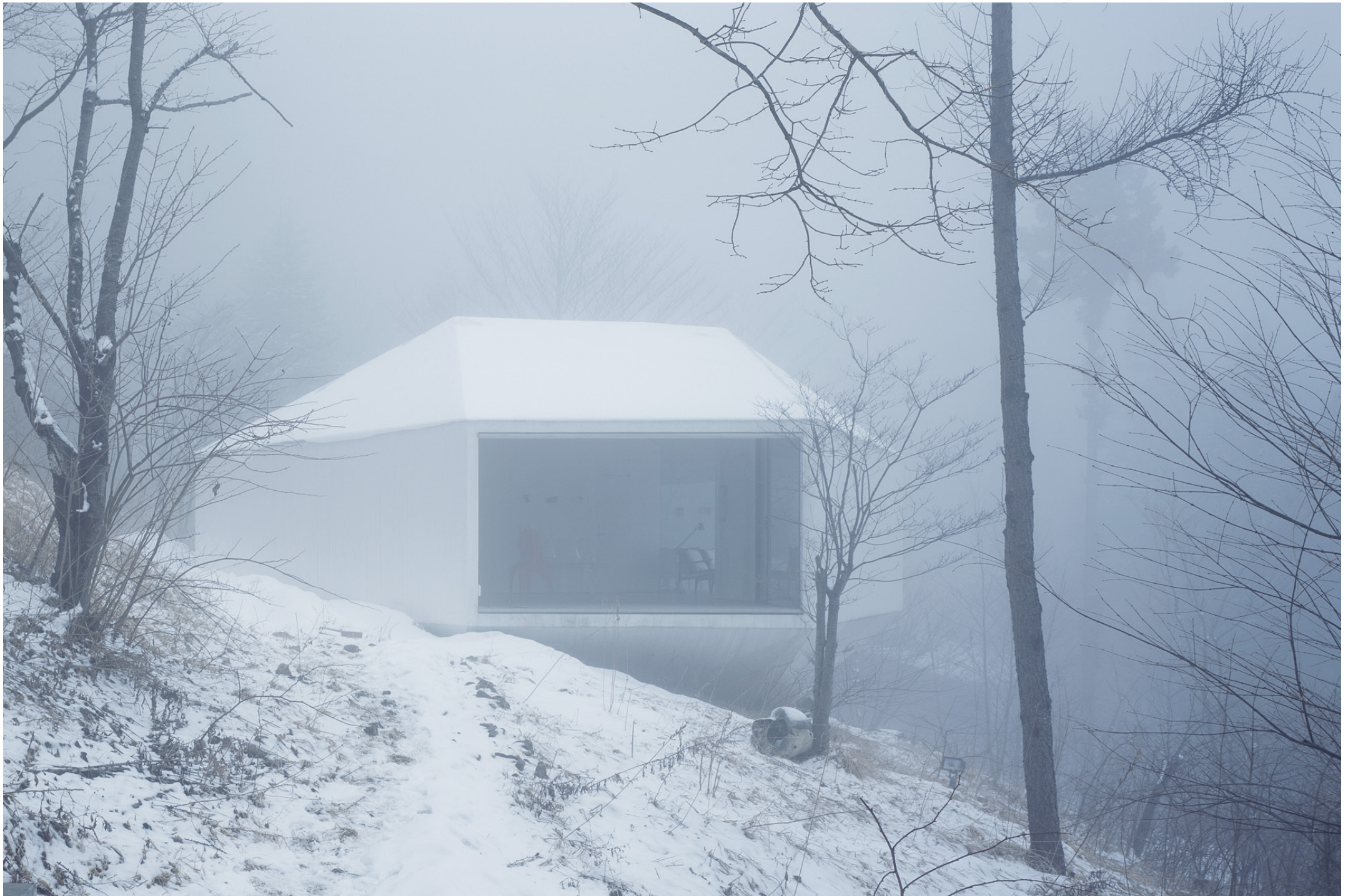
Villa / Gallery in Karuizawa