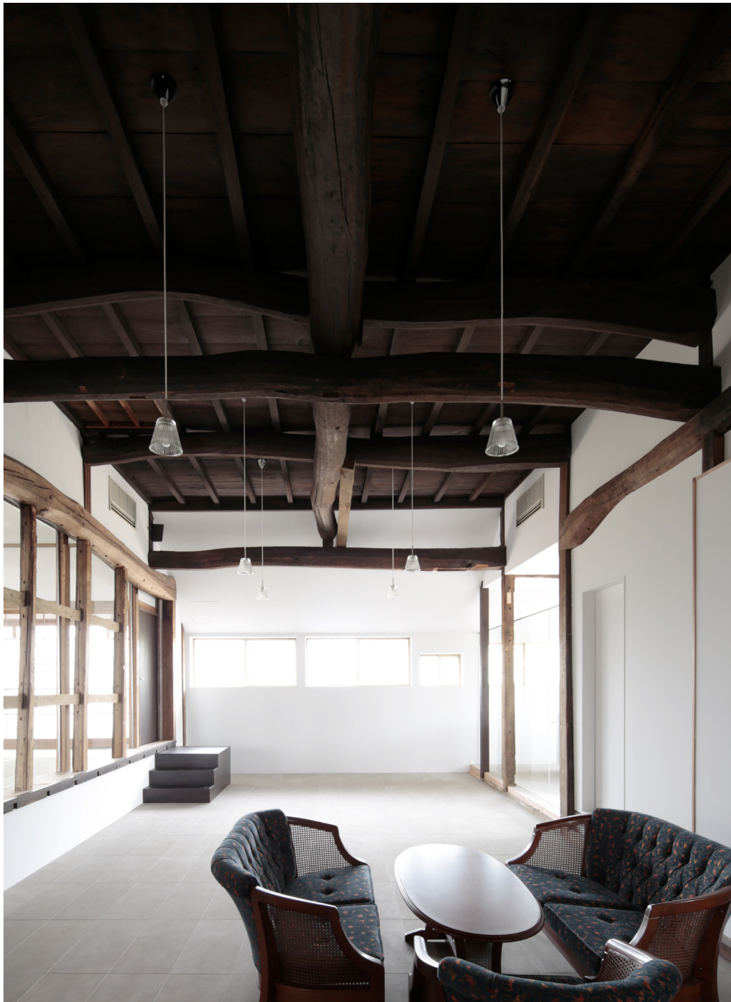
Salon in narimasu