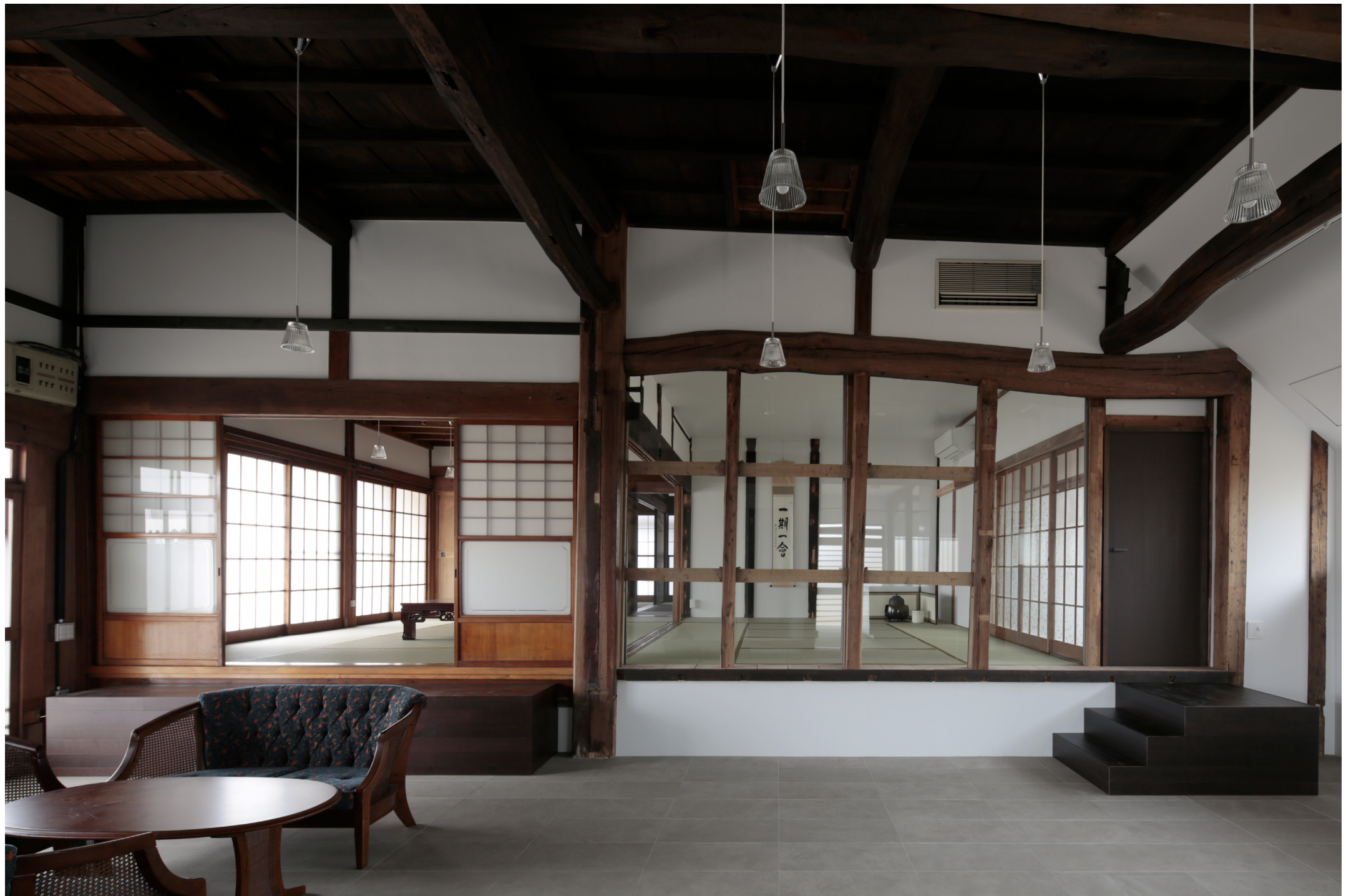
Salon in Narimasu