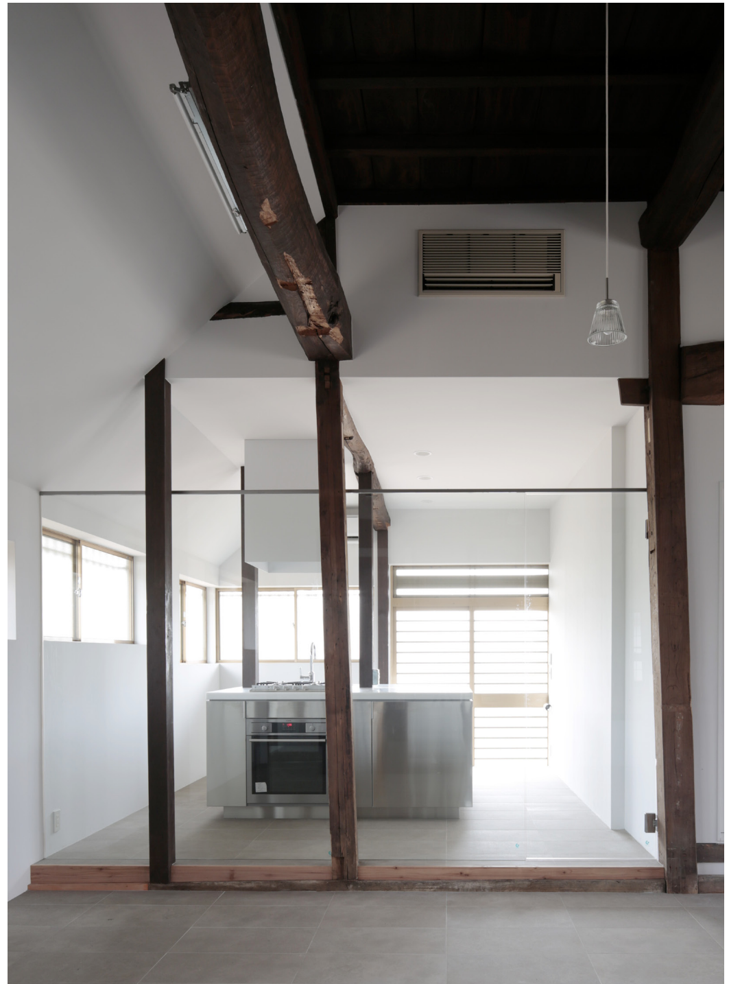
Makoto Yamaguchi Design Inc.