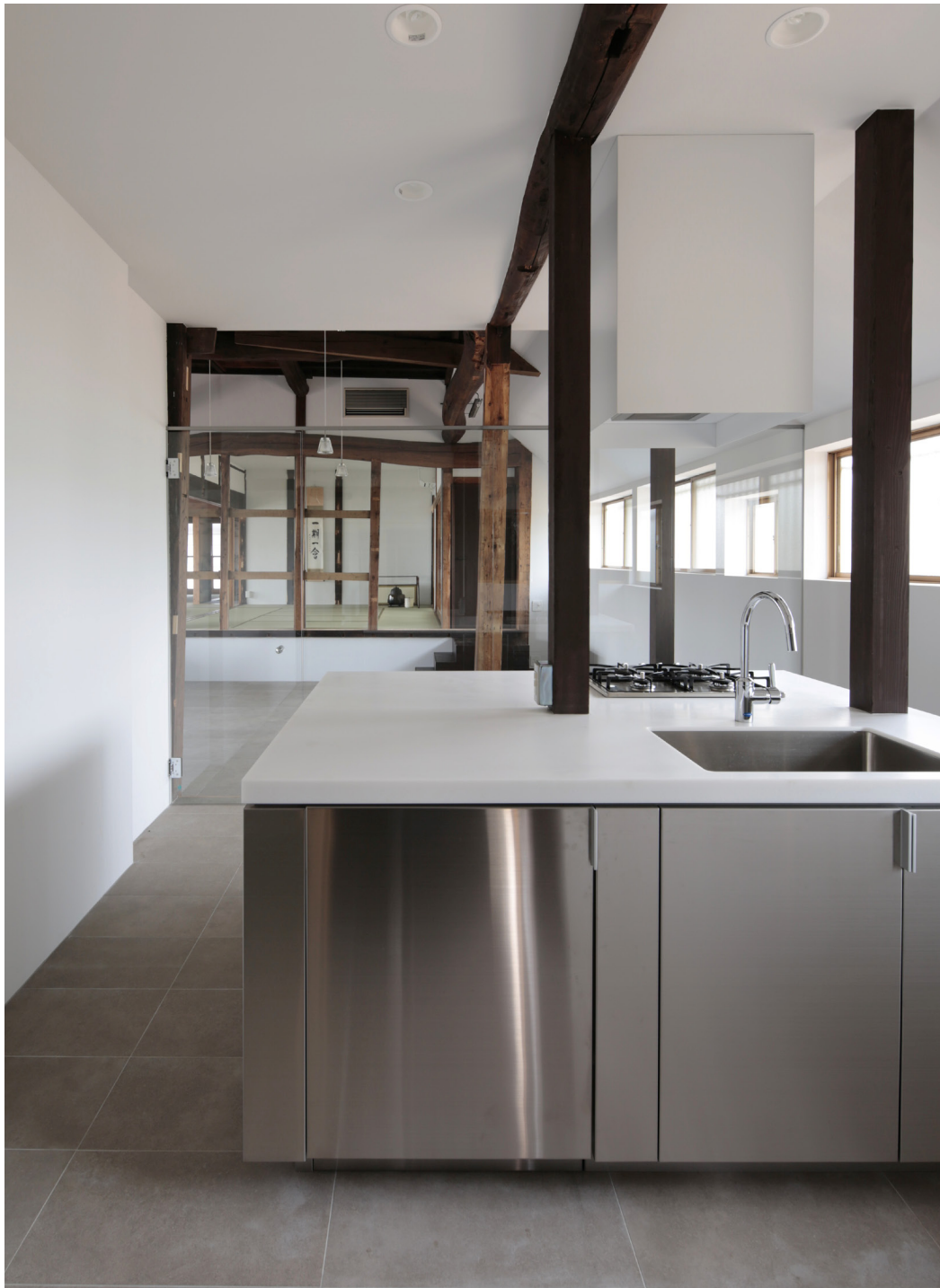
Salon in narimasu