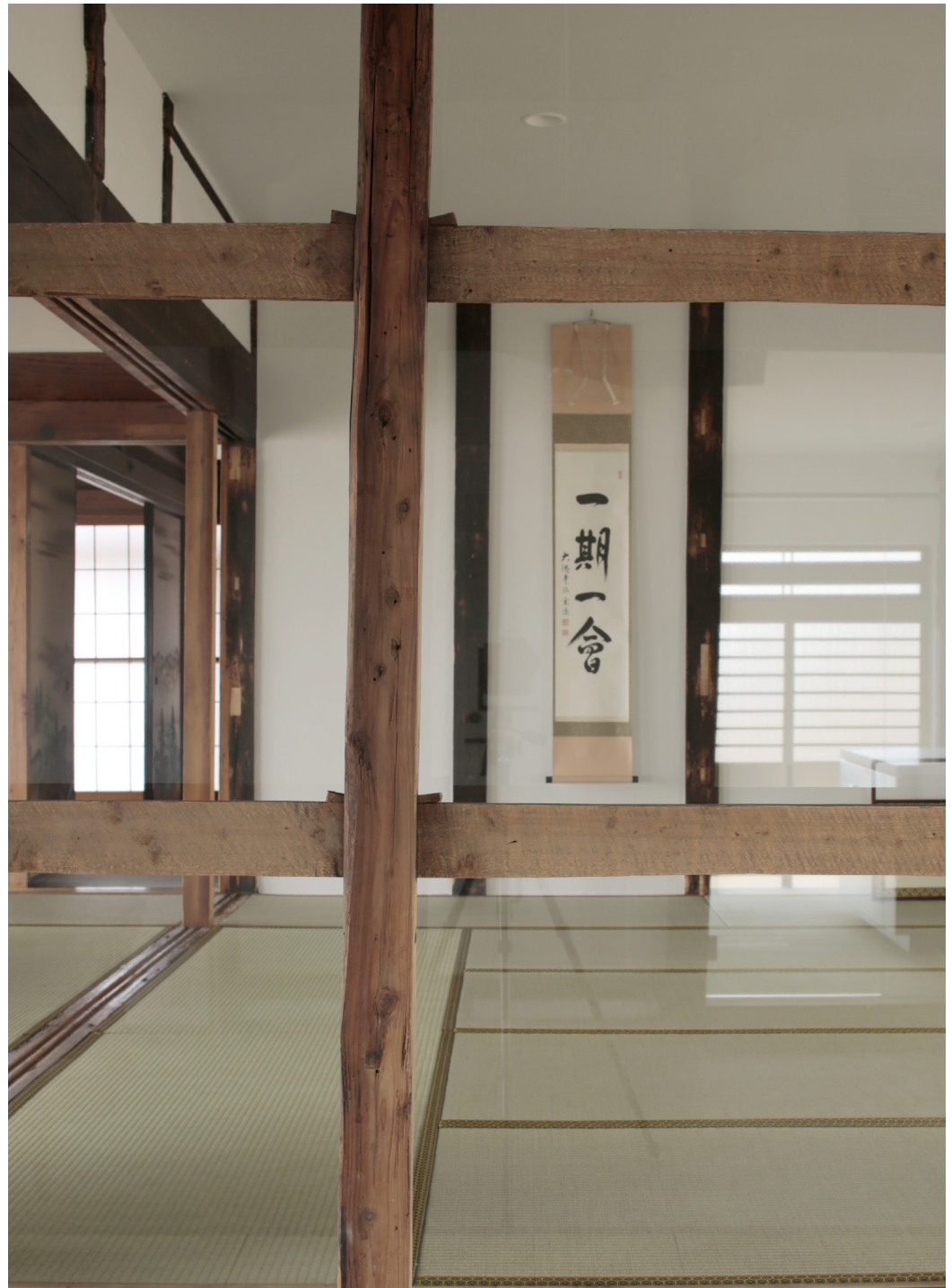
Makoto Yamaguchi Design Inc.