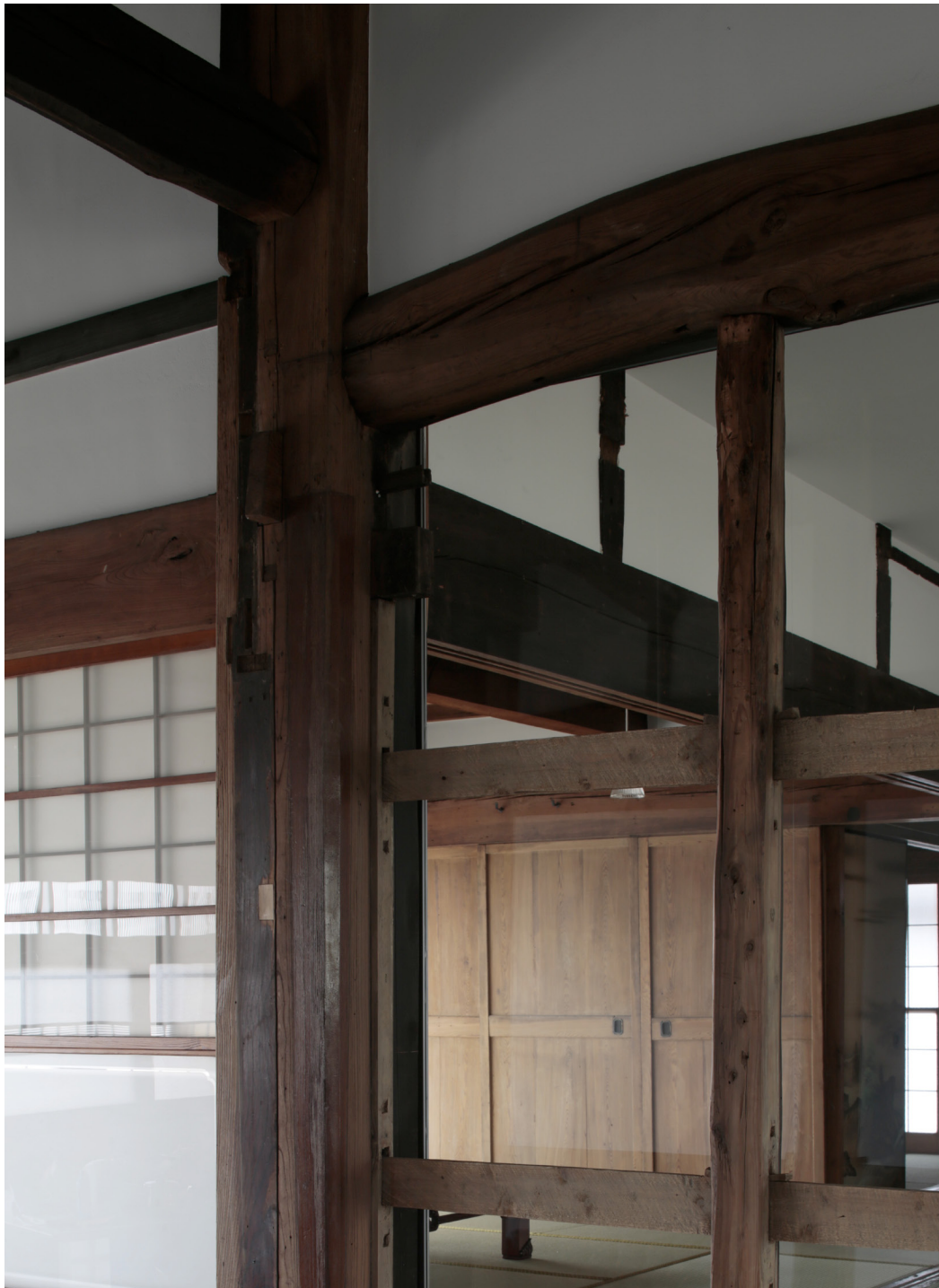
Salon in narimasu