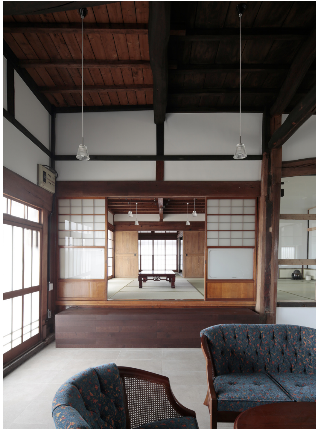
Makoto Yamaguchi Design Inc.