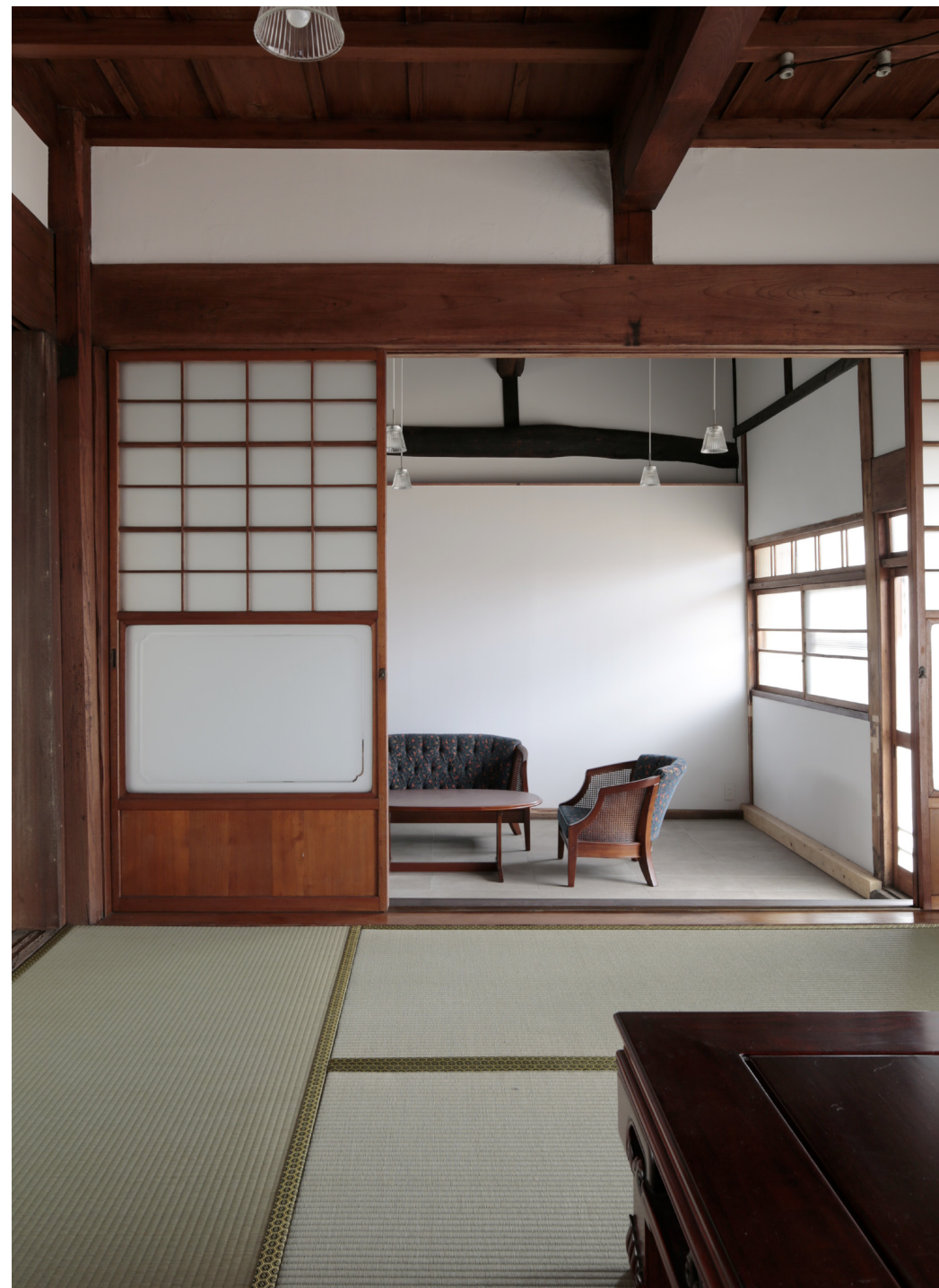
Salon in narimasu