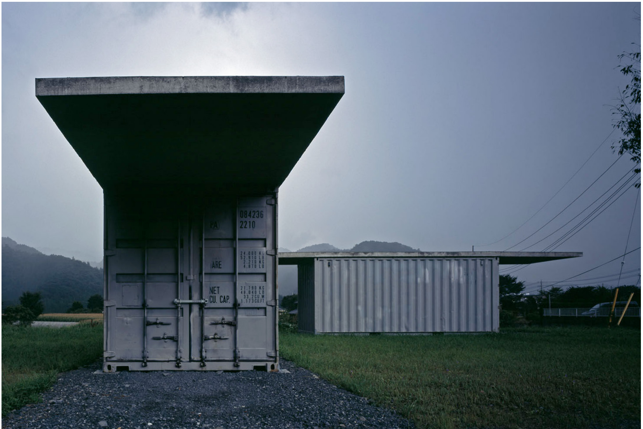
Storage for Kimyogumi