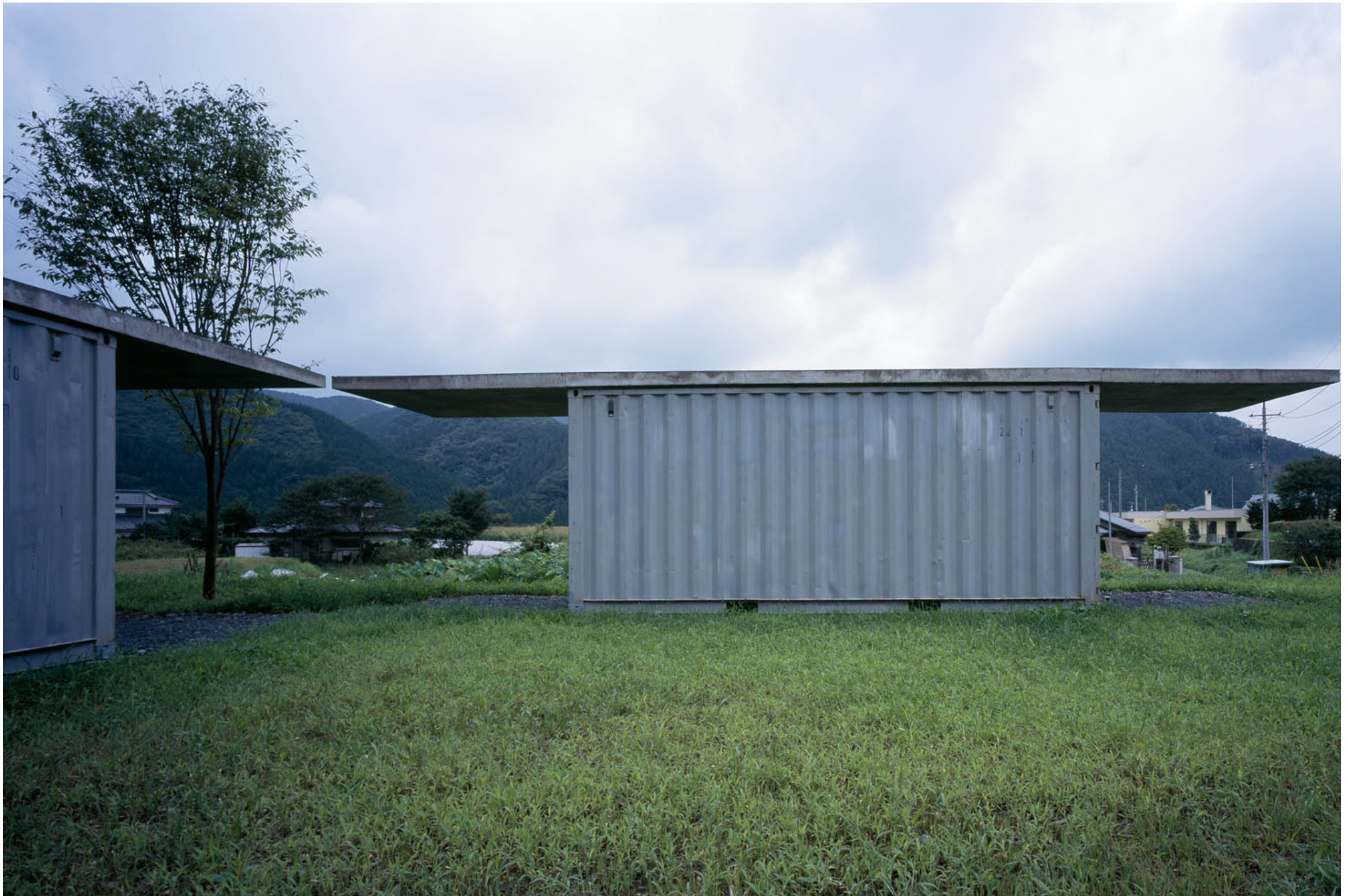
Storage for Kimyogumi